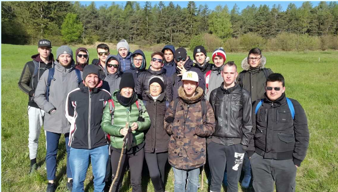
Group photo shot.