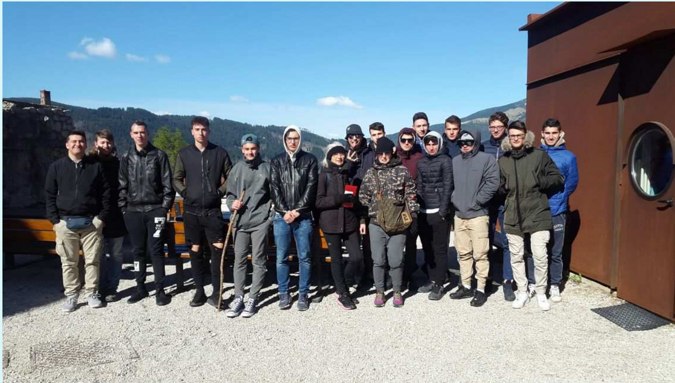
Group photo shot.