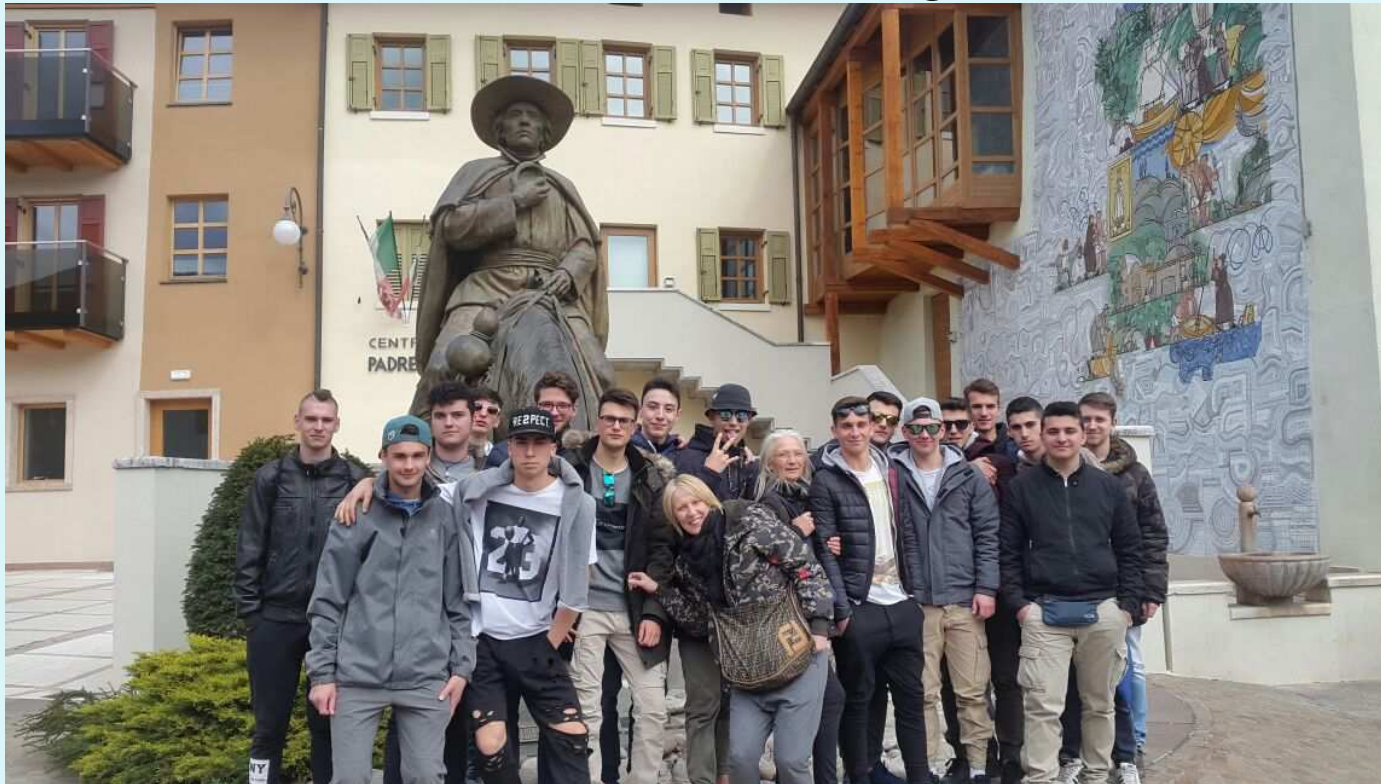
Group photo shot.